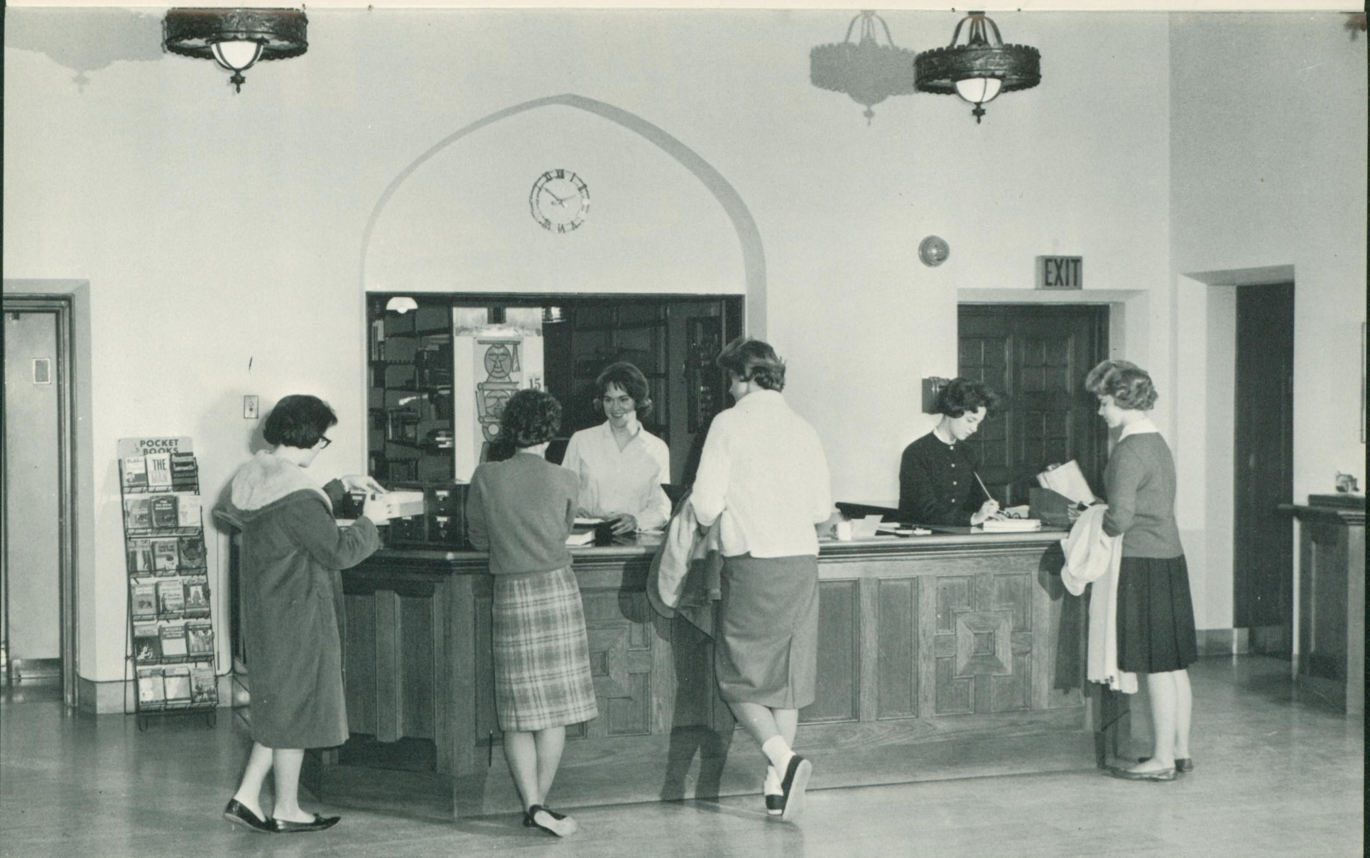
At the circulation desk three students are checking out books while another examines the "closed reserve" card index. Working behind the desk are student aides. Among the various campus jobs available in the library are typing, filing, shelving returned books, creating displays, and assisting at the circulation desk.