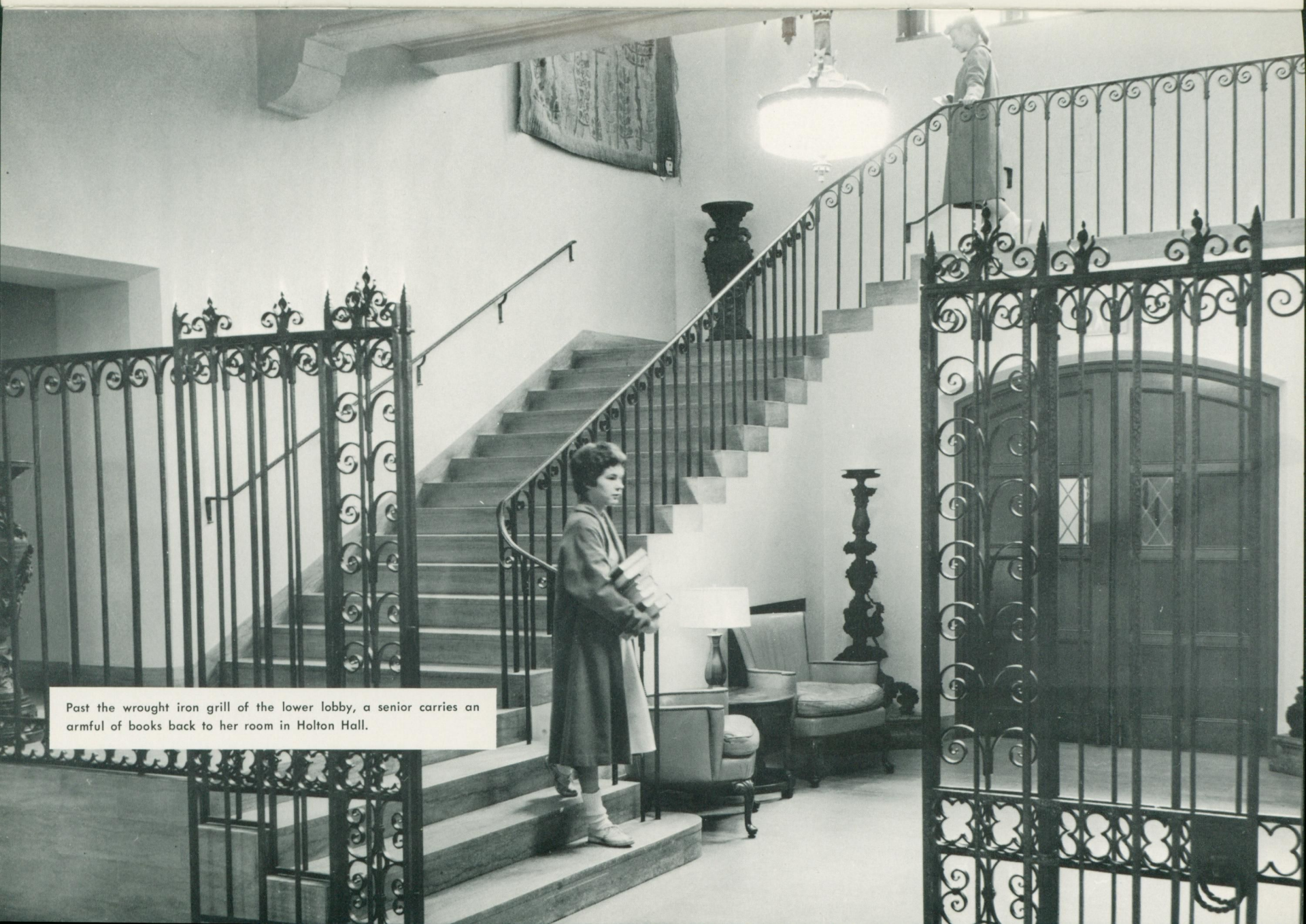
Past the wrought iron grill of the lower lobby, a senior carries an armful of books back to her room in Holton Hall.