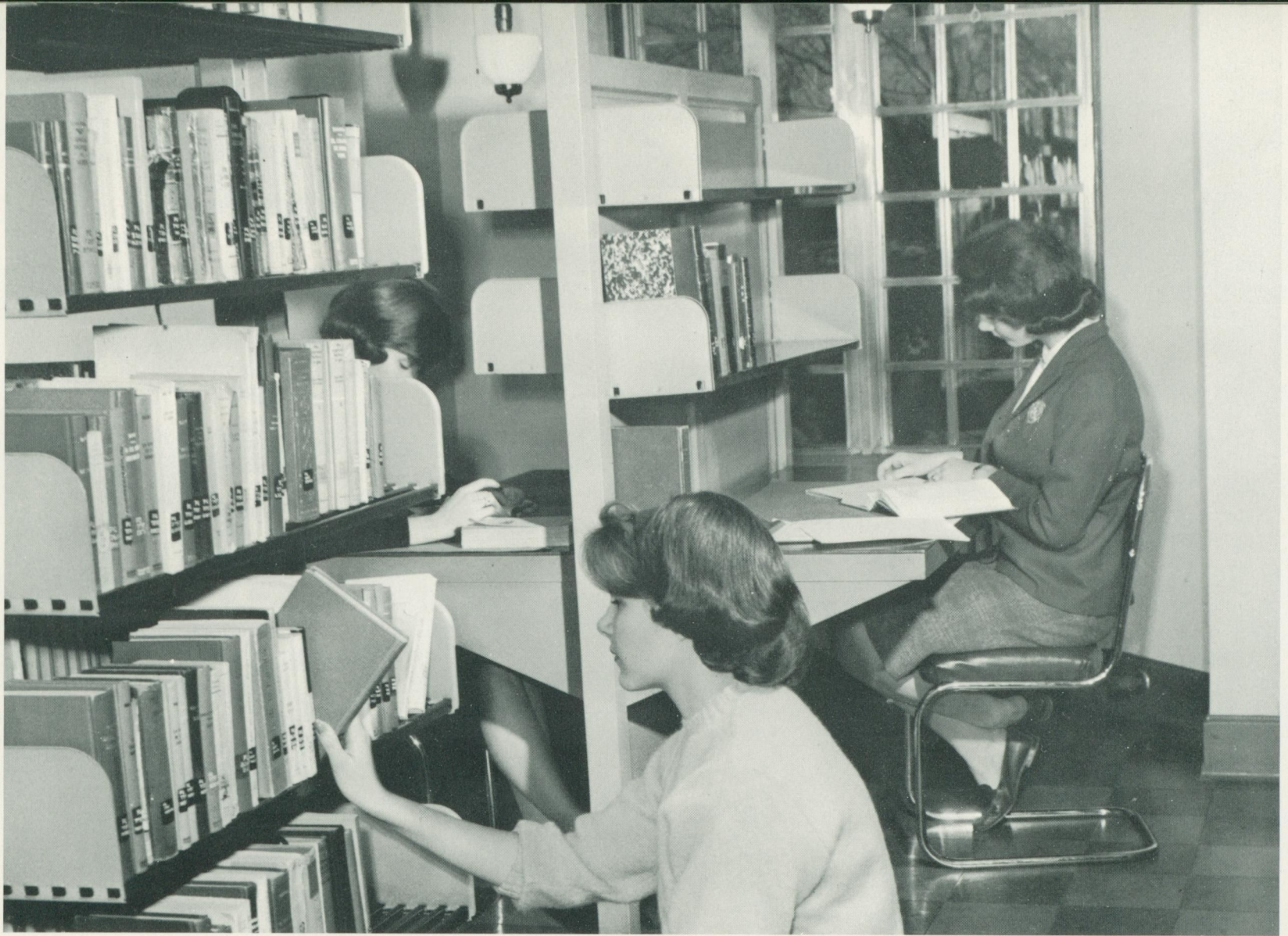
The Stacks are open not only to the librarians but to the questing student herself. Circulation of books per student has tripled in the past ten years.