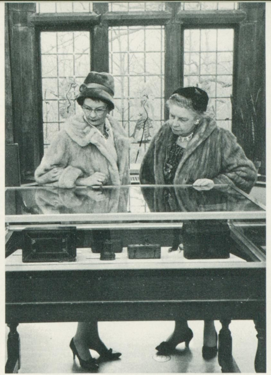
Visitors from the city as well as the campus come to view exhibitions in the Art Gallery. Above, guests are examining Medieval and Renaissance objets d'art. Left, students inspect contemporary tapestries.