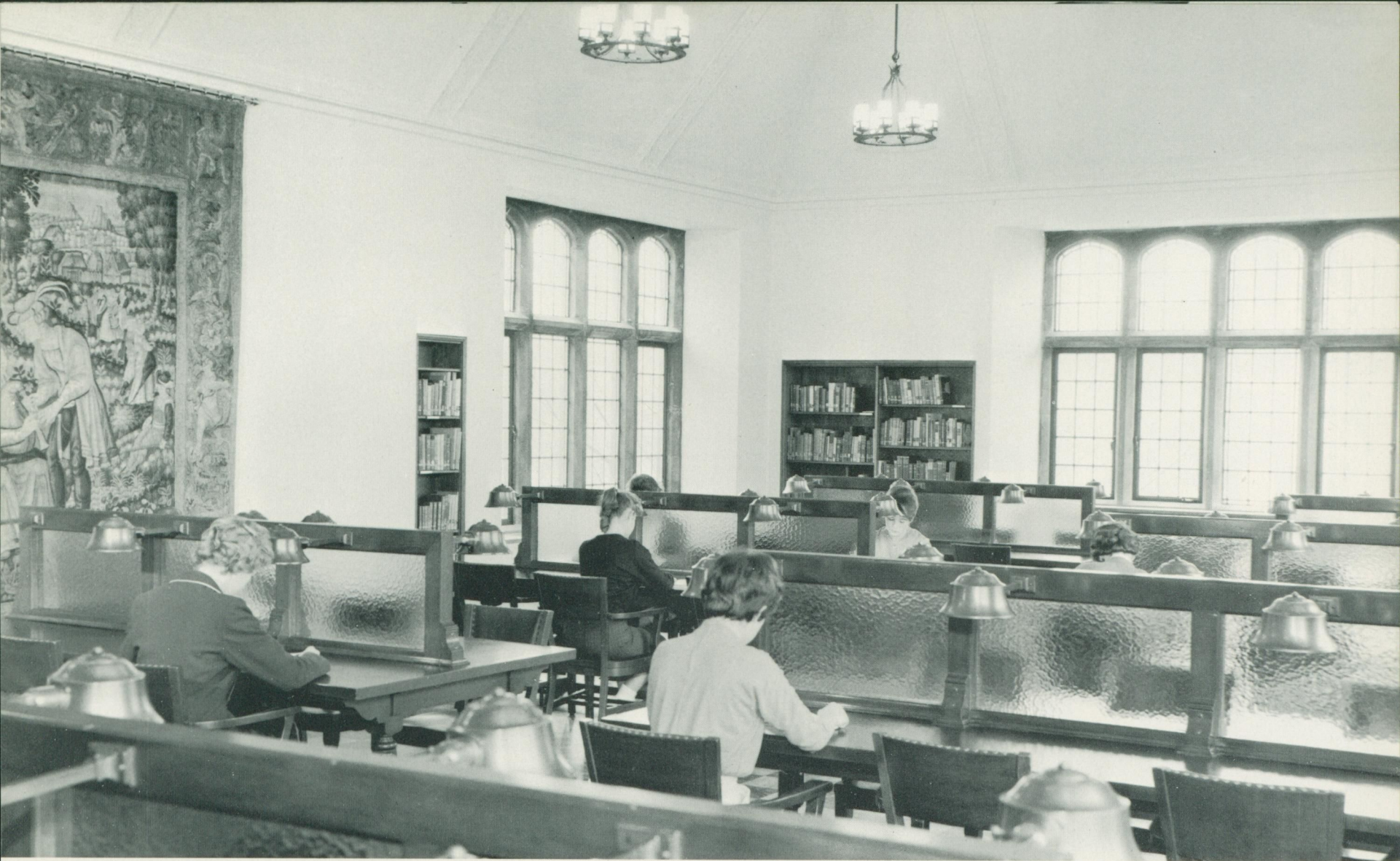
In addition to books and high leaded windows a 17th century Flemish tapestry, recently acquired, adorns the Reserve Reading Room.