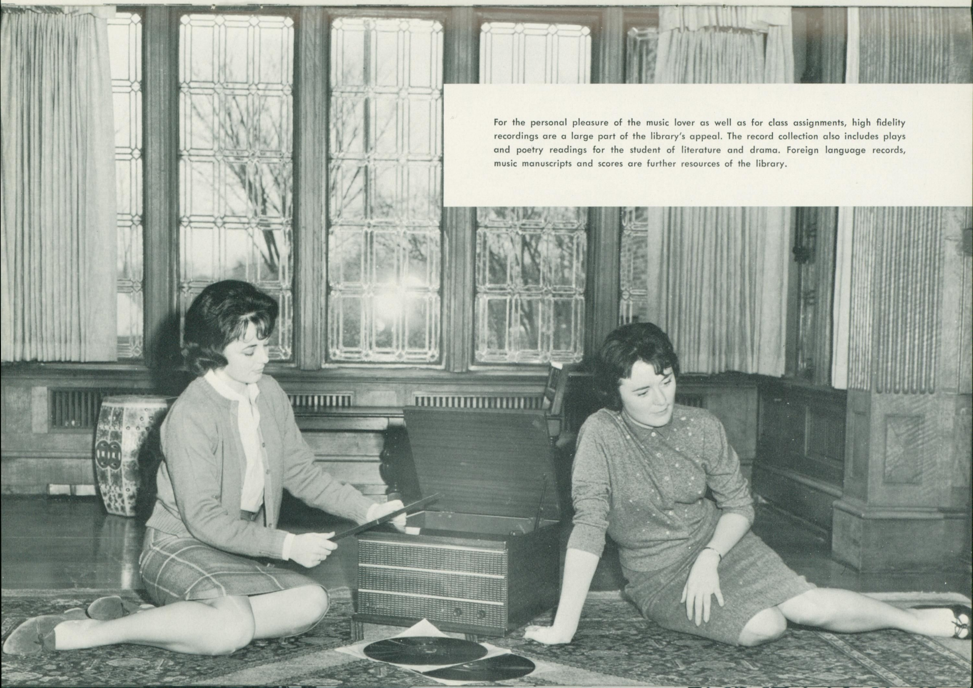
For the personal pleasure of the music lover as well as for class assignments, high fidelity recordings are a large part of the library's appeal. The record collection also includes plays and poetry readings for the student of literature and drama. Foreign language records, music manuscripts and scores are further resources of the library.