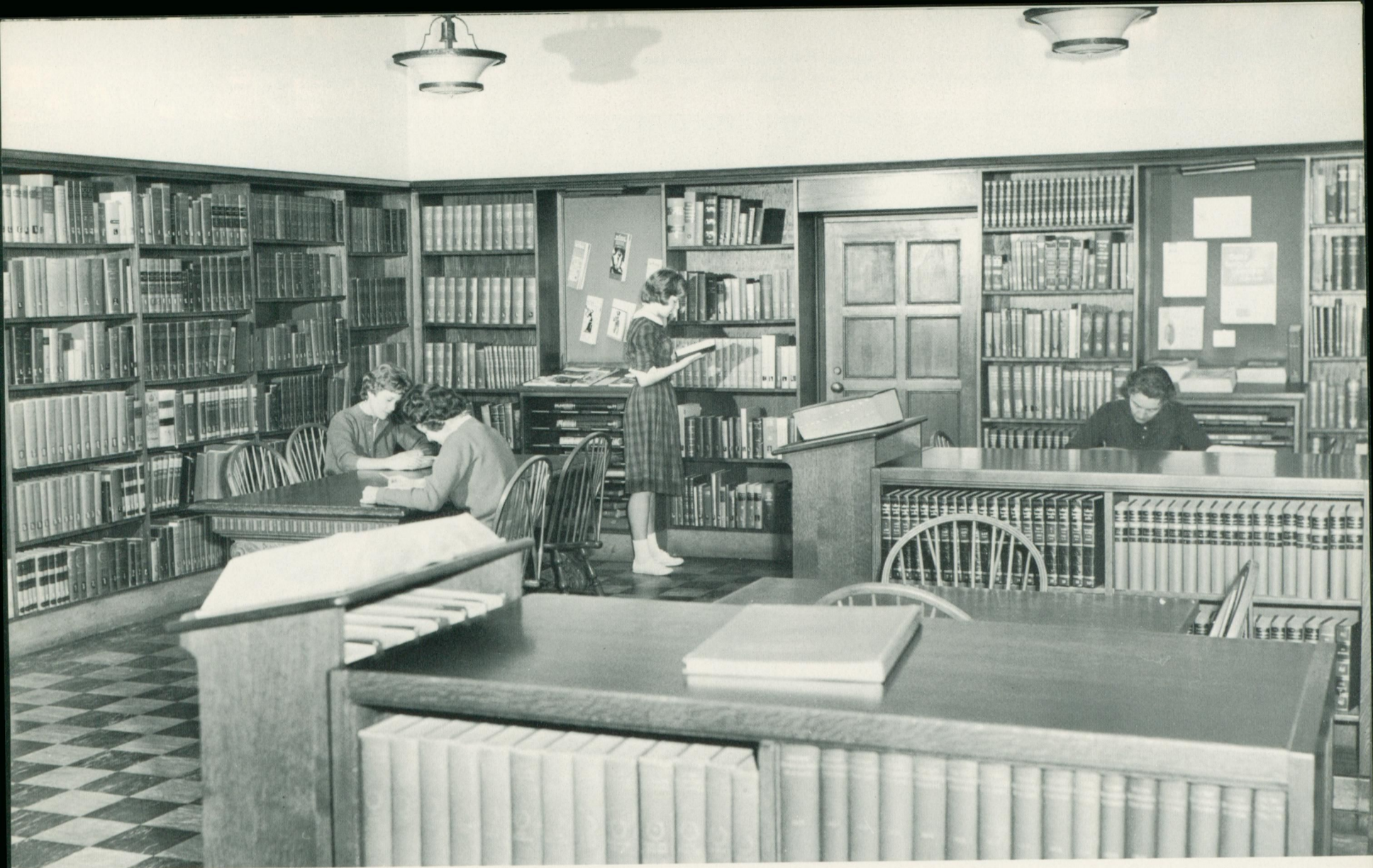
The Reference Room provides a vast area of knowledge in compact space.