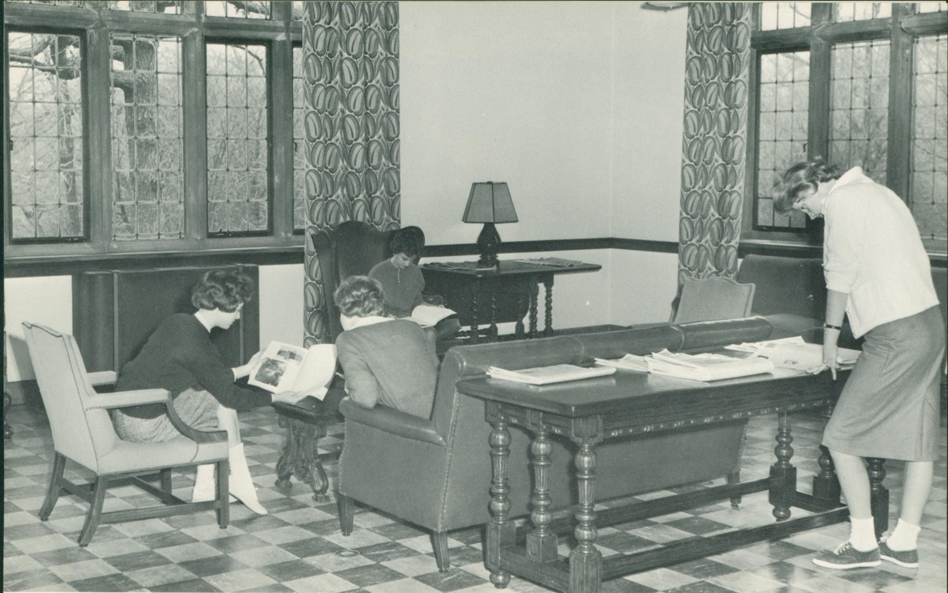
The Browsing Room looks out on hawthorn trees and great oaks. Here, with shoes on or off, students relax to read a magazine, newspaper, or a work of current fiction.