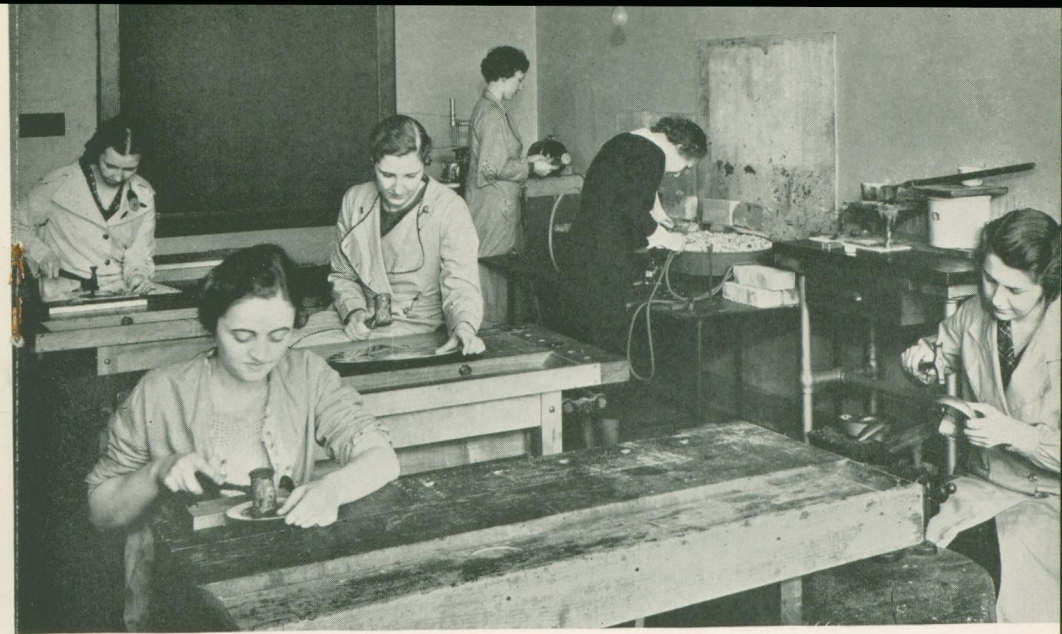
A class in metal work and jewelry, a craft that appeals to many patients.

The College reserves the right to demand the withdrawal of any student or to withhold the diploma, if, in the opinion of the authorities, the student is not suited to the work.