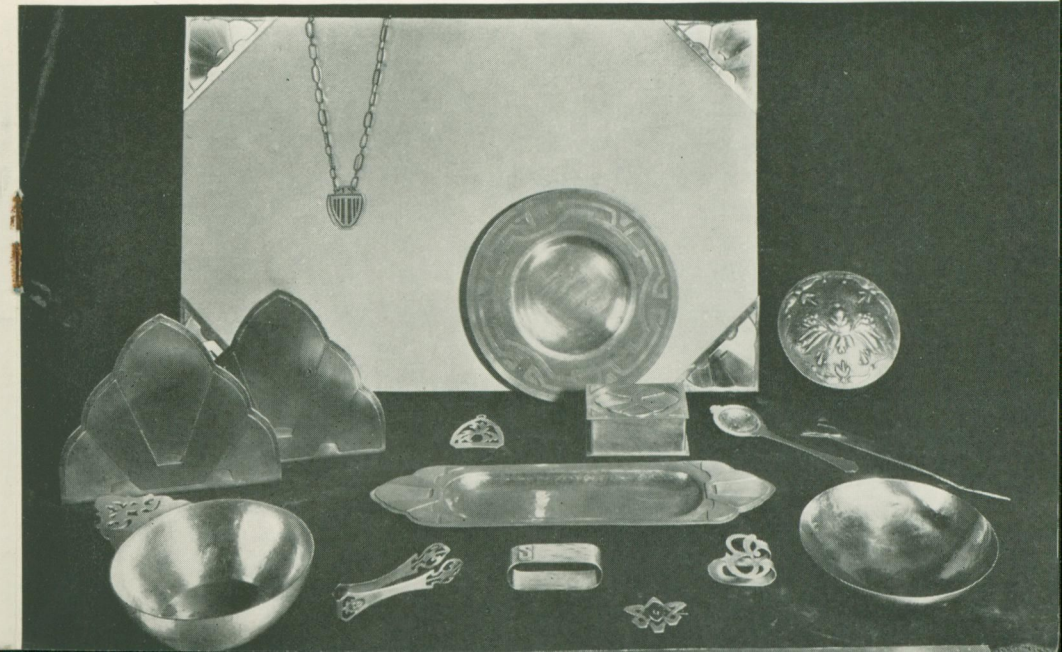
Some of the projects made by the students while studying the principles of metal work.