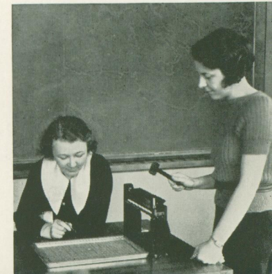
A psychological experiment on the acquisition of a complex motor skill in which the elements involved are time and force.

This intensive training is planned to give the student clinical experience in treating all types of physical and mental diseases and disabilities, thus enabling her to correlate theory and practice, and to become familiar with hospital procedure. The diploma is not granted until satisfactory completion of the required clinical training.